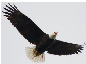
Healing in His Wings